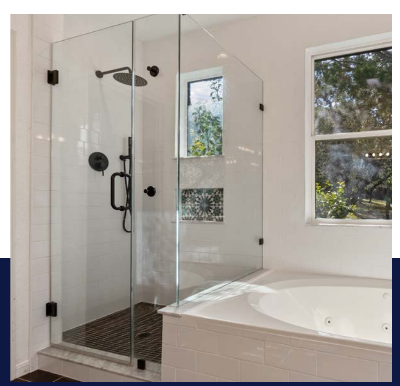
Frameless Reverse Shower Door