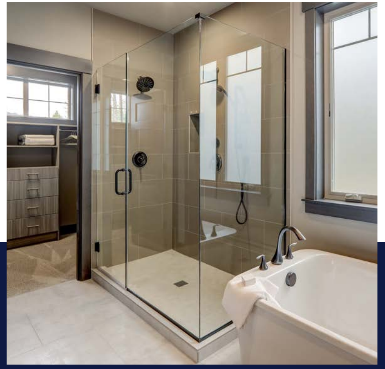
90° Semi-Frameless Unit Shower Door