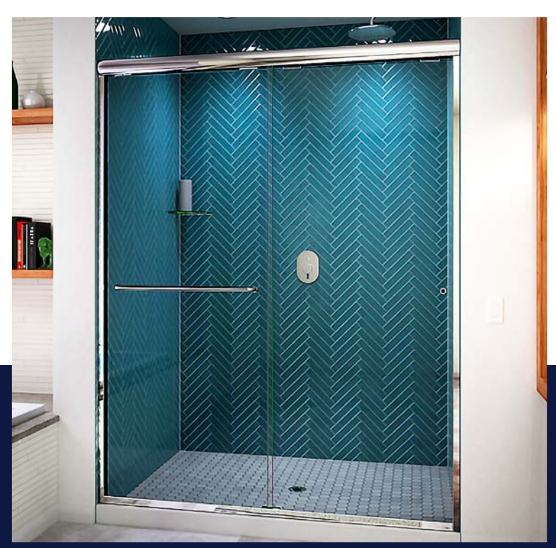
Euro Slider Shower Door