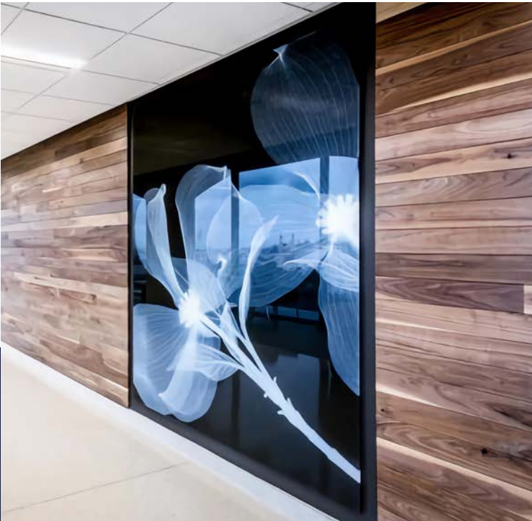
Photo Realistic Image