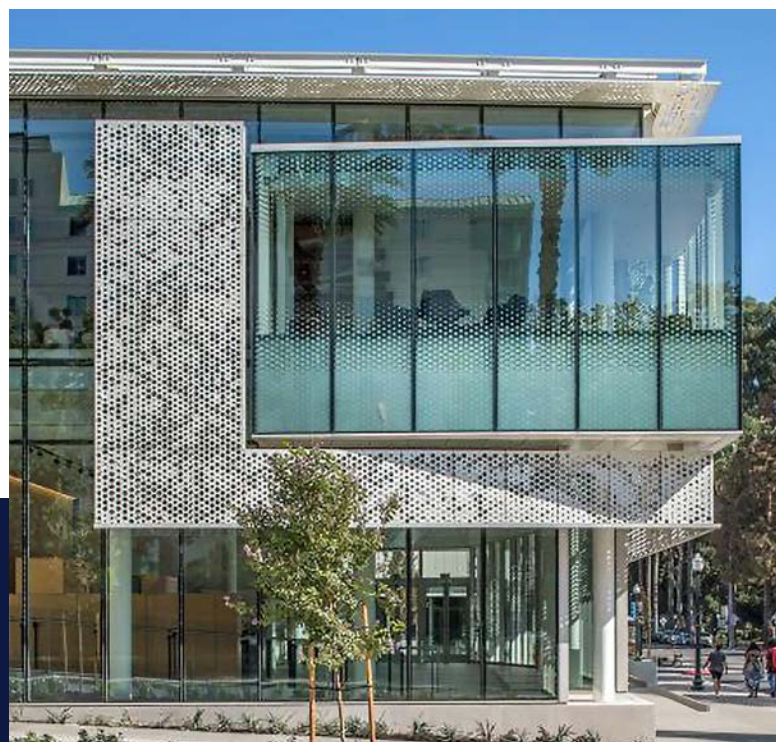
Custom Gradient Frit Pattern (Hexagon)