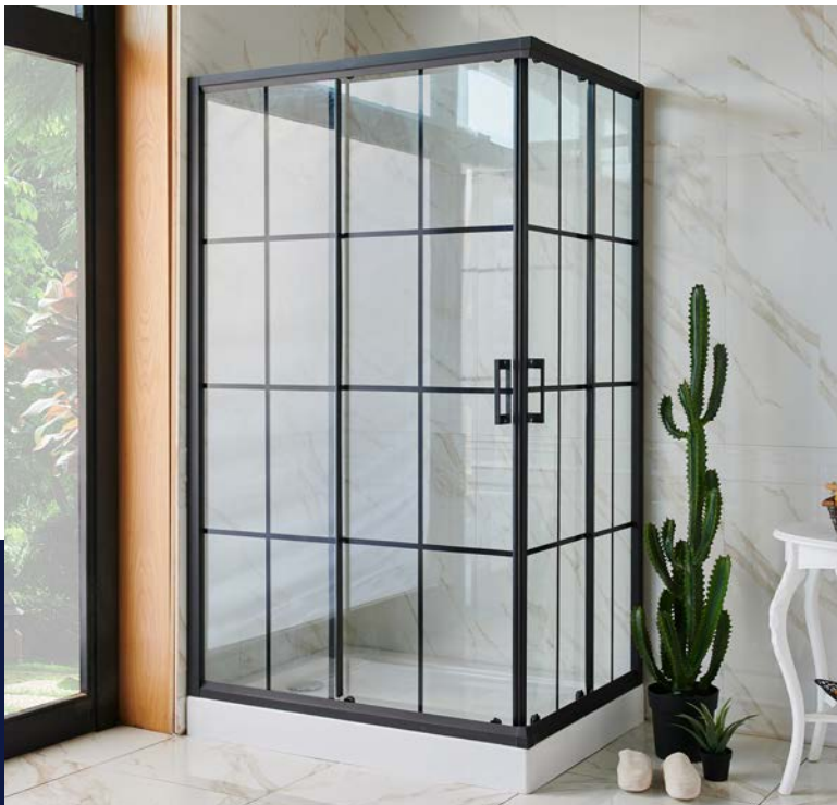
Custom Grid Pattern