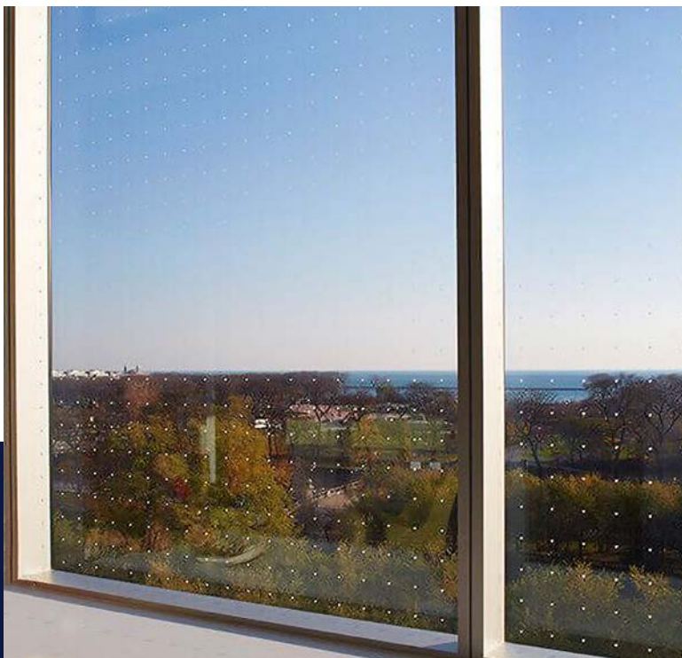
Dots And Lines (Bird Friendly)