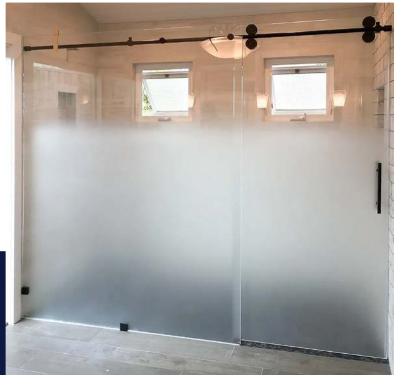
Custom Etch Gradient