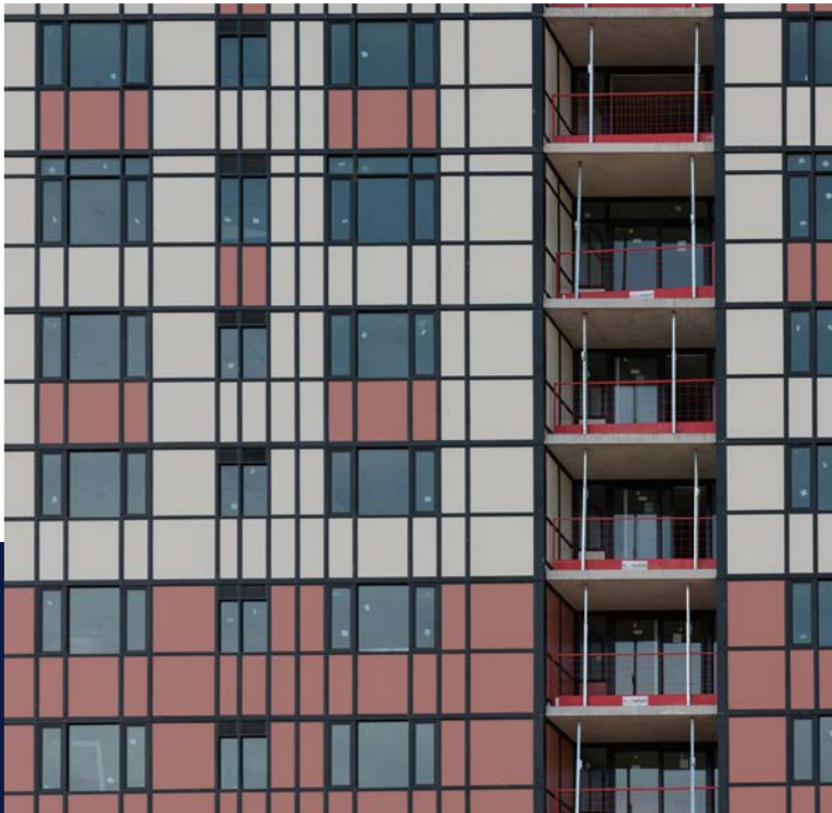
Spandrel Flood Coat